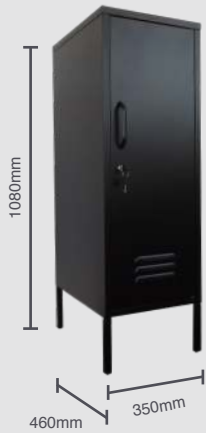
1080H MINI LOCKER